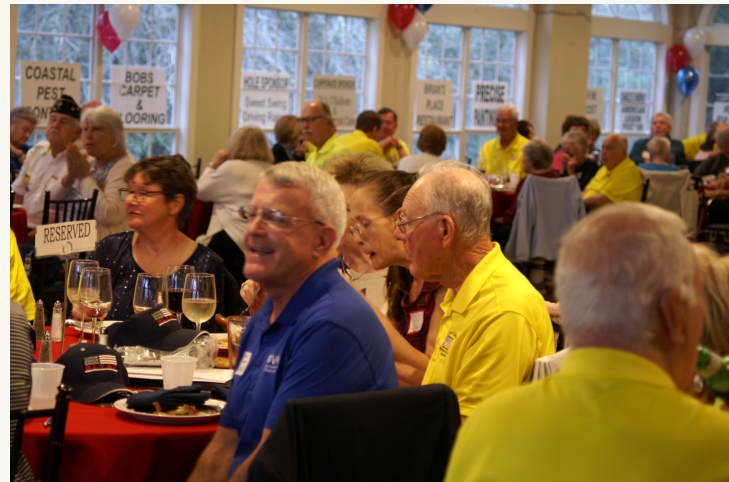
Members and guests enjoying great conversation....