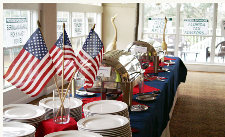
and also enjoying a great GlenLakes Club buffet ...