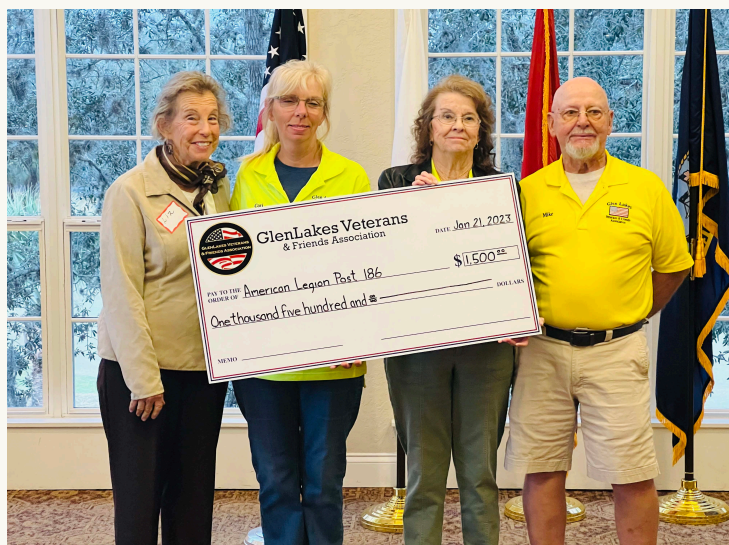
all while giving back to the community!