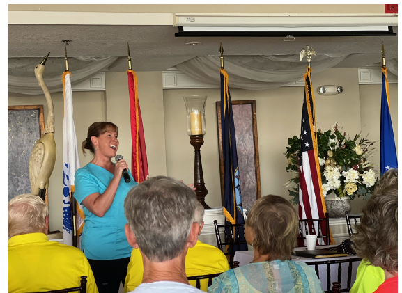
Monthly meeting: Presentation and live demonstration on pain therapy technology from Neurolumen, Oklahoma City, OK