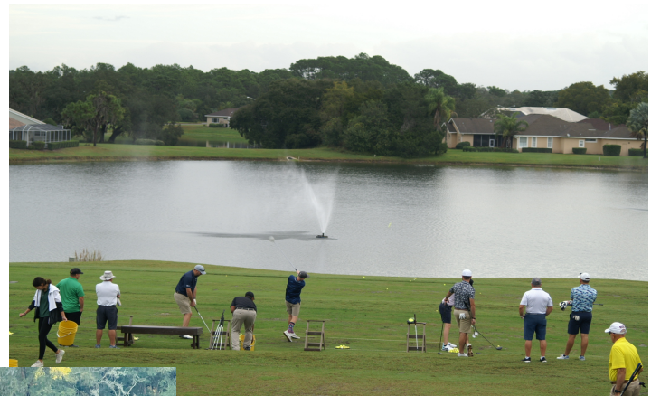
GLVFA Veterans Day Golf Event