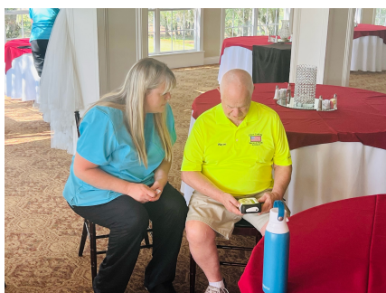
(above) Members show unity by wearing our distinctive GLVFA "yellow shirt"