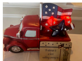
Support Patriotic Cause