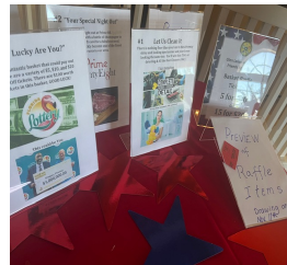
Certificates / Golf Rounds