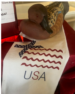
Hand Carved Ducks