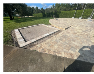
Memorial Brick "Garden of Honor"

GlenLakes Veterans & Friends Association % GLVFA, P.O. Box 5253, Spring Hill, FL 34611