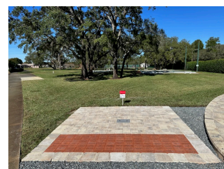
Memorial Brick "Garden of Honor"