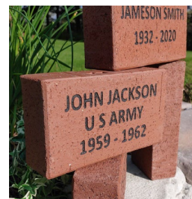
Sample Brick Inscription

The attached donation form offers an opportunity for appreciative GlenLakes community residents and local area citizens to show support in helping to maintain this beautiful memorial through their generous donations. The form also offers an opportunity to purchase a memorial brick that will be added to the "Garden of Honor" that pays tribute for your loved one who honorably served.