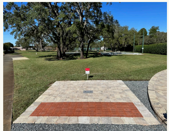
Aerial View Of The "Brick Garden Of Honor"