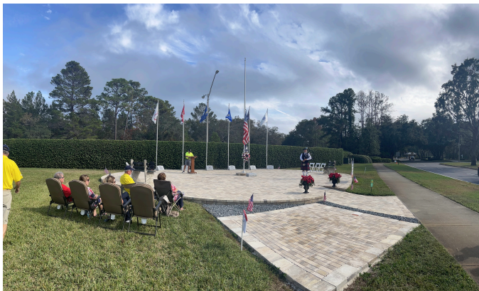
November 12, 2024 Memorial Dedication & Garden of Honor