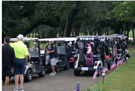
Parade of Carts, Ready for Tee-Off!

The GlenLakes Memorial Team has begun the next phase of the memorial project by creating a square area as shown above, designed to hold 450 memorial bricks. If a resident desires to obtain a brick in honor of a loved one who honorably served our country, please order your memorial brick by visiting the GLVFA website for further details, brick inscription examples, and brick order form. https://www.glenlakesvets.org/brick_program