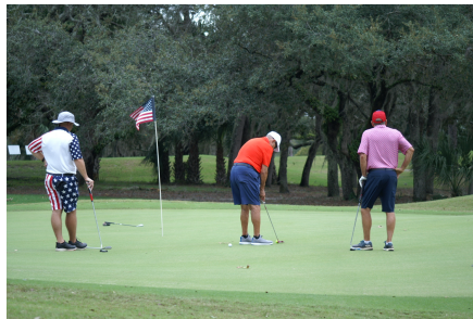
Patriotic Players Enjoying the Links